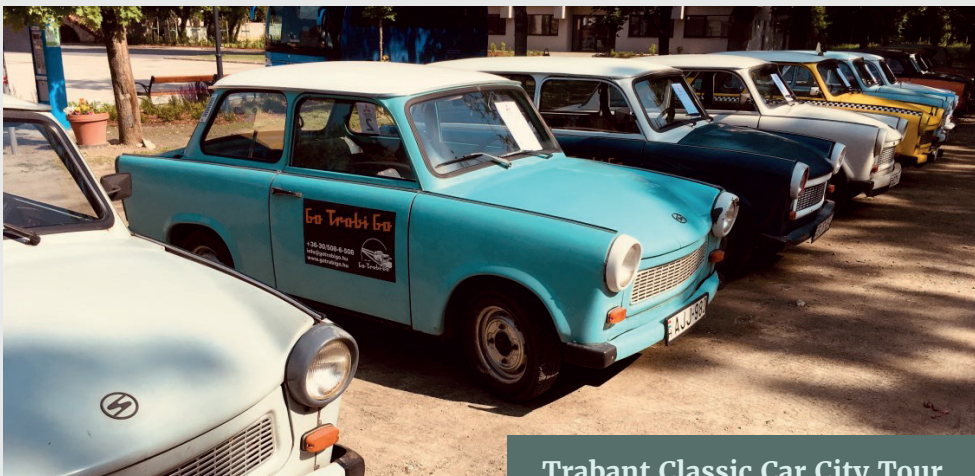
Trabant Classic Car City Tour

PLEASE NOTE: The walking tour of the Castle District lasts approximately 1 1/2 hours, the walk isn't too strenuous and The Buda Castle Funicular will transport you up to the Castle District and back down again.