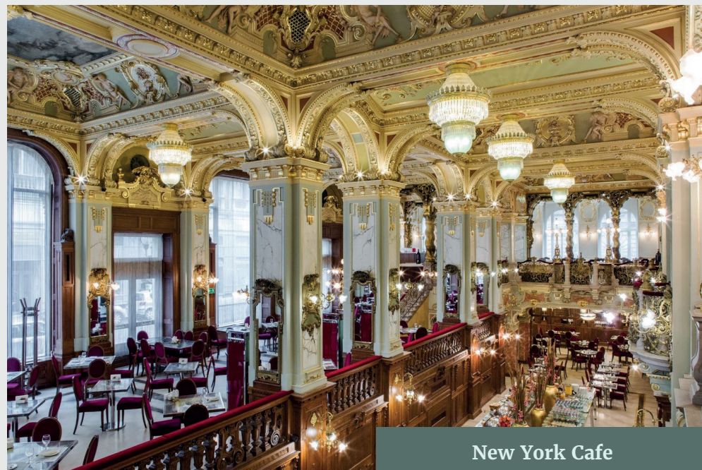
New York Cafe

Please note that the itinerary could be subject to alteration nearer the time. If we do have to amend the itinerary, you will still receive the same level of hospitality throughout your stay.