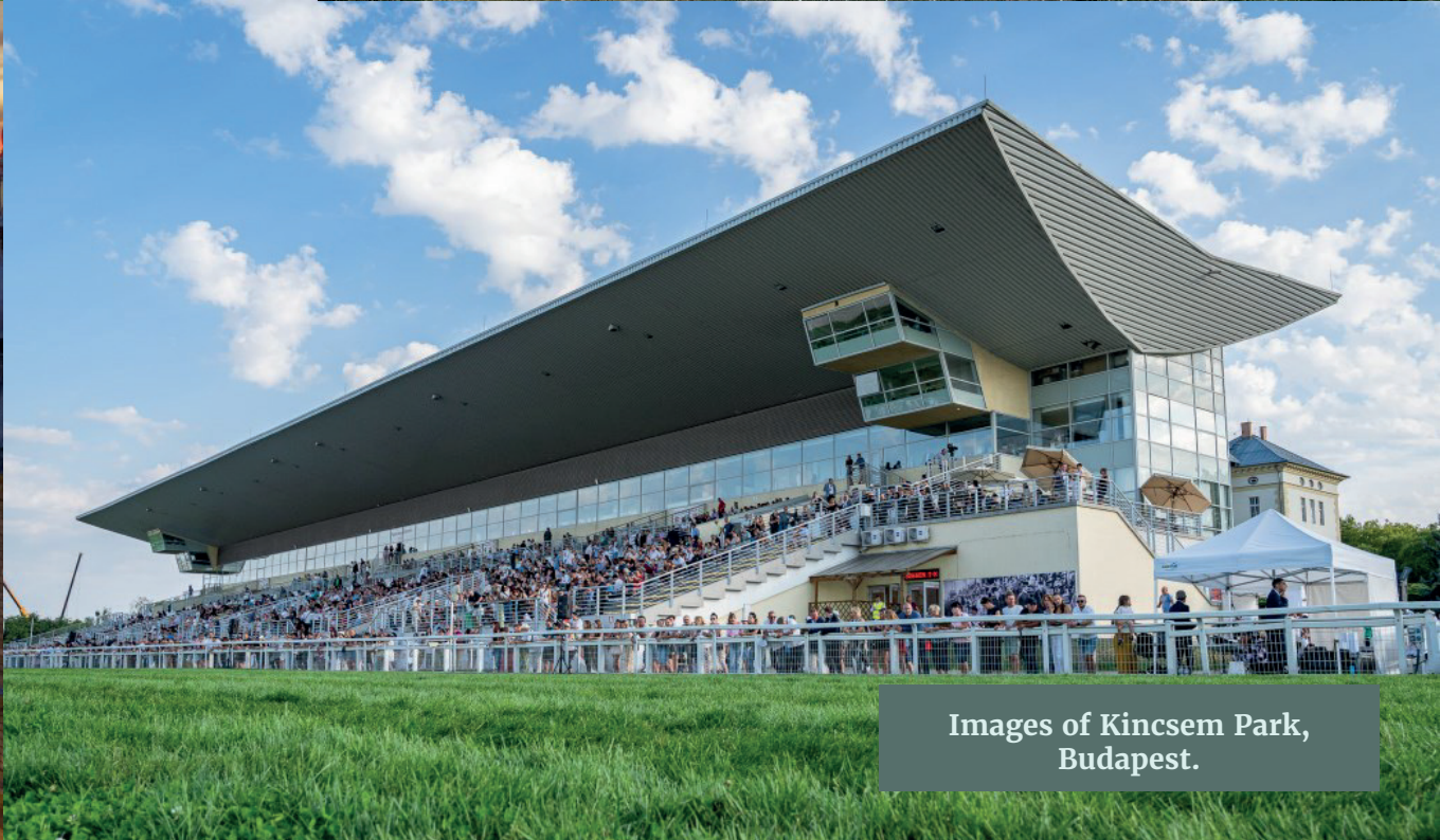
Images of Kincsem Park, Budapest.