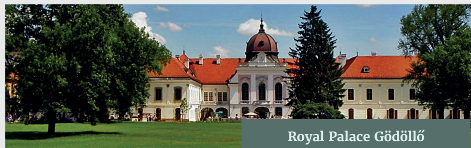
Royal Palace Gödöllő

Following the river cruise the coach will collect you and return you to your hotel.