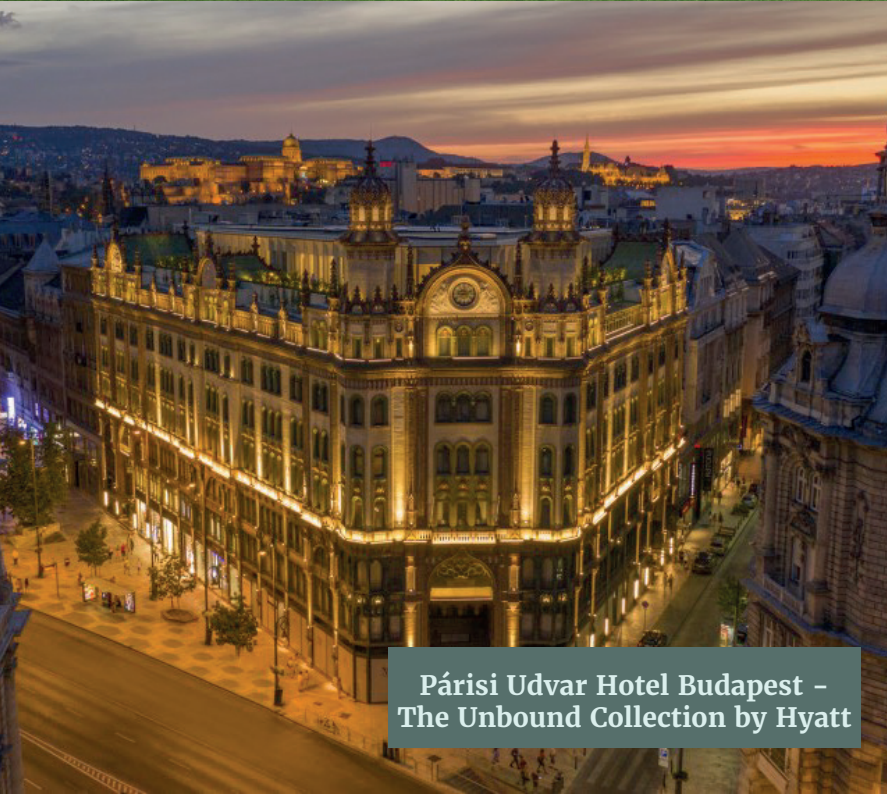
Párisi Udvar Hotel Budapest - The Unbound Collection by Hyatt